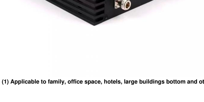
(1) Applicable to family, office space, hotels, large buildings bottom and other indoor places.