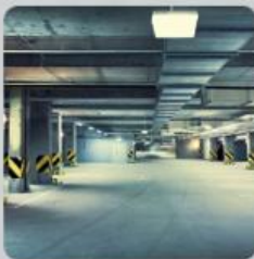
• THE BASEMENT