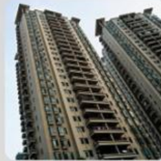
• INTENSIVE FLOOR