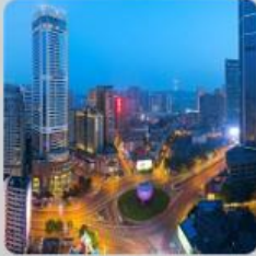
• THE CITY