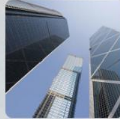
• HIGH-RISE OFFICE BUILDING