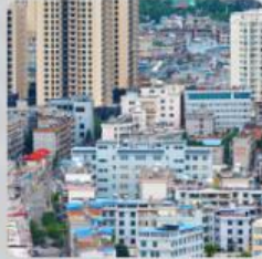
• CITIES AND TOWNS