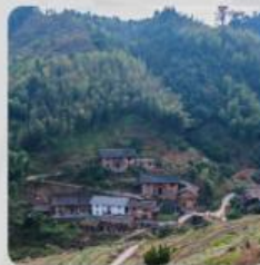
• THE MOUNTAINS