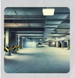
• THE BASEMENT