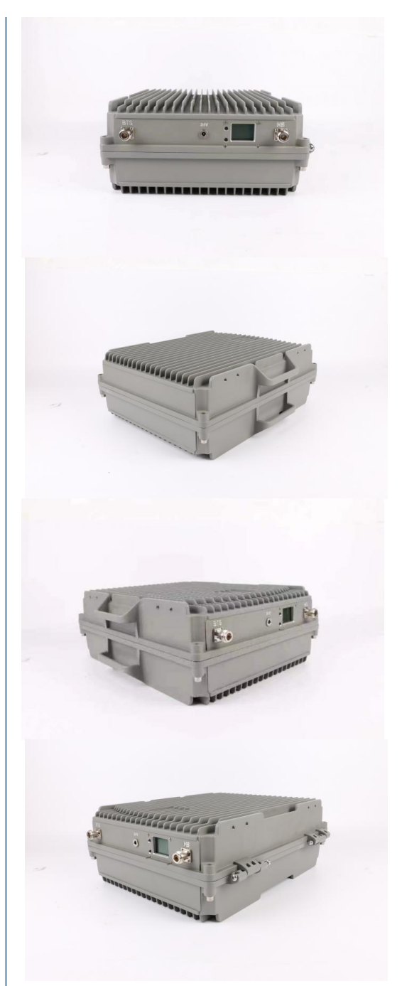
Accessories & Installation